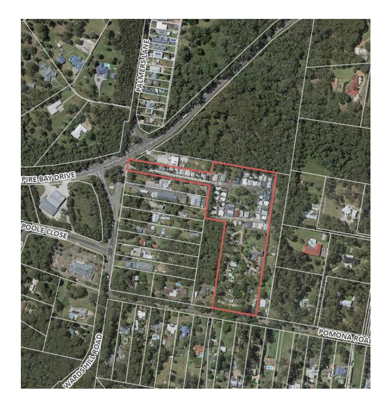
Figure 1 - Aerial Photograph of Empire Bay site

The subject site (Figure 1) is an "L" shaped lot, 3.67 Ha in area, with frontages to Wards Hill Road and Pomona Road, Empire Bay. The site accommodates a caravan park, comprising approximately 68 relocatable homes, laundry building, amenities building, an office and a manager's dwellinghouse.