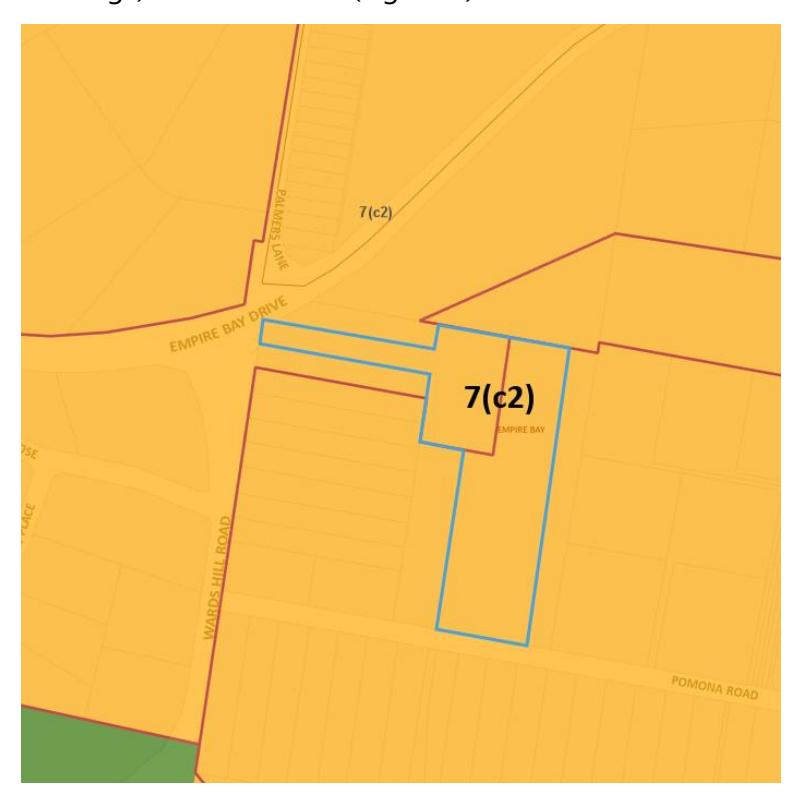
Figure 2 – Existing Zoning under IDO 122

The whole site is zoned 7(c2) Conservation and Scenic Protection (Scenic Protection - Rural Small Holdings) under IDO 122 (Figure 2).